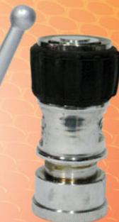
VARIABLE HEAD NOZZLE