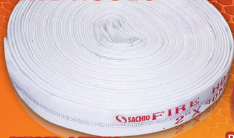
RUBBER LINING FIRE HOSE