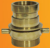
MACHINO MALE ADAPTOR