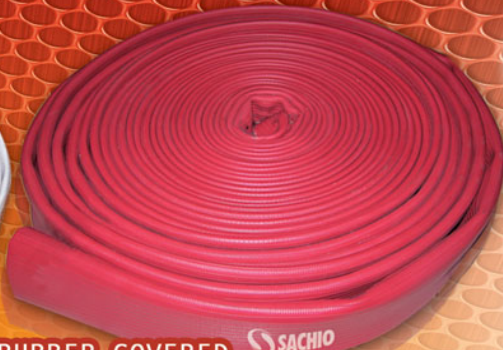
RUBBER COVERED FIRE HOSE