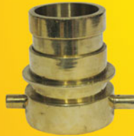
MACHINO FEMALE ADAPTOR